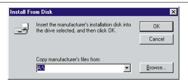
Figure 11. Install from diskette

Insert the diskette provided with the modem into diskette drive A:.