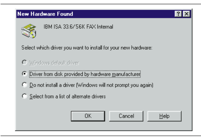
Figure 10. New Hardware Found Dialog

If you do not see this screen, then go to Step 12 on page 2-2.