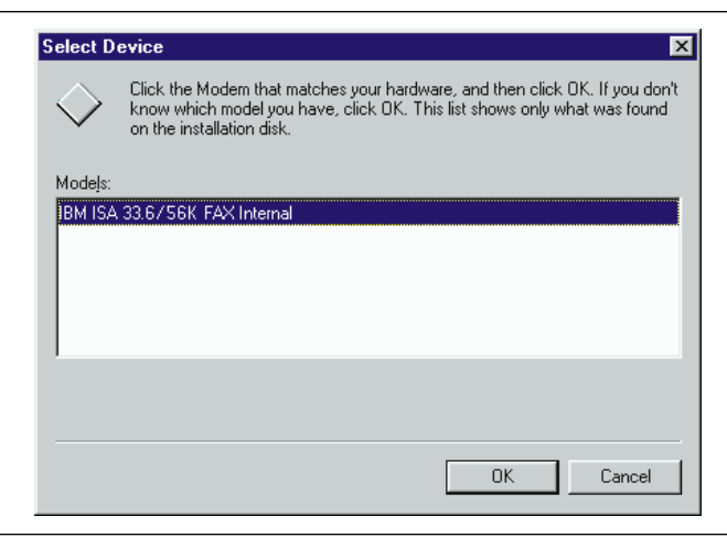
Figure 12. Select Device

8. Click on OK . You will then see a panel similar to: